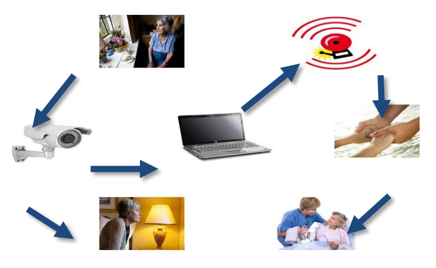
Figure 1: Typical Fall detection System